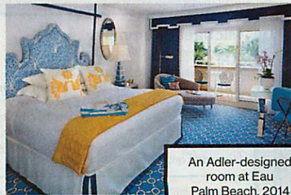
An Adler-designed room at Eau Palm Beach, 2014

"One day a customer on their phone said, 'Oh, I'll be home at 8—I'm at Jonathan Adler right now.' And I was like, 'Oh! I'm a place!' When I had a store, suddenly I became a brand."