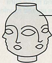
Jonathan Adler Giant Dora Maar Vase, $550