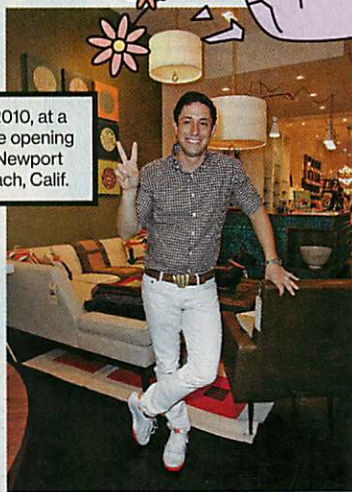
In 2010, at a store opening in Newport Beach, Calif.