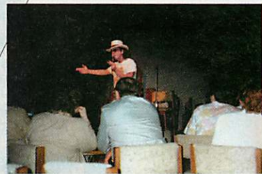
Doing stand-up in 1987

"I went to Hollywood and tried to write a screenplay with a buddy, until we couldn't stand each other. Then I got screwed up on drugs and went home to Boston."