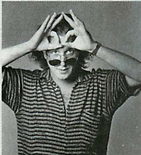
A head shot from 1987

"I did Conan O'Brien three or four times a year, did a talk show pilot, an HBO half-hour, two scripts for NBC, got married, got divorced. The career wasn't working out that great."