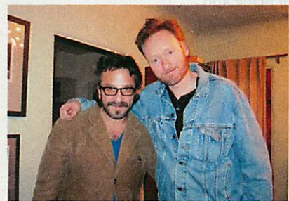
With Conan O'Brien in 2011

"I did Conan O'Brien three or four times a year, did a talk show pilot, an HBO half-hour, two scripts for NBC, got married, got divorced. The career wasn't working out that great."